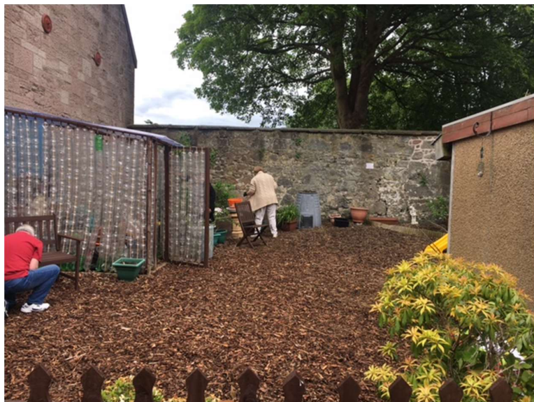
Eco Garden and bottle greenhouse at Oakshaw Trinity

Please consider applying for an Award in your own church to recognise your environmental work and help us secure funding from partners to support more activities. Any registered eco-congregation that is a Full Member of the charity can apply.